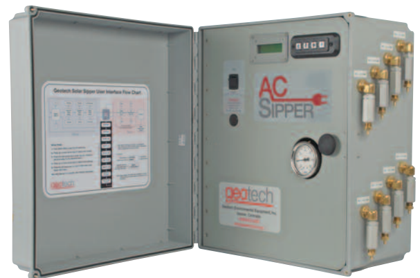
Control Panel and Pressure/Vacuum Pump (eight-well controller shown)

The Geotech AC Sipper is also available for recovery of sinking product (DNAPL) from wells when using a fixed intake.