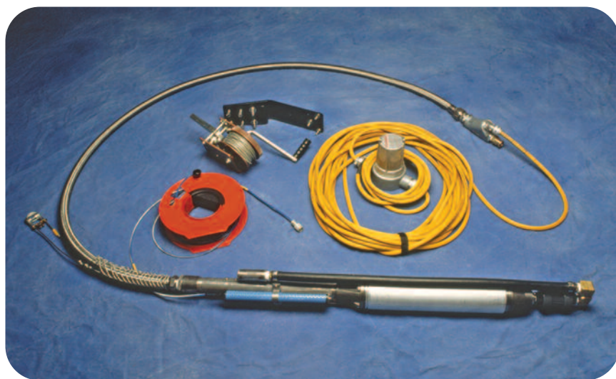
Geotech High Volume Probe Scavenger System with Optional Lifting Winch