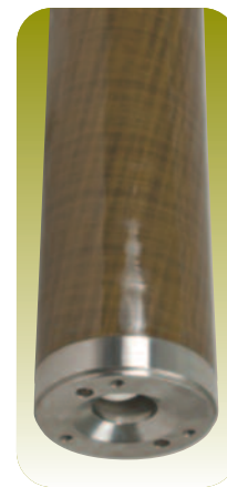
Bottom Fill with No Screen