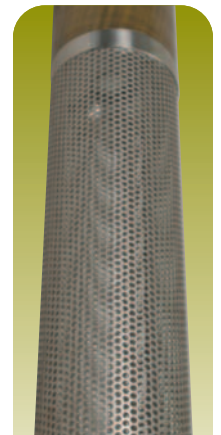
Bottom Fill with 12" (30.5cm) Screen