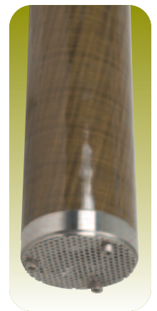
Bottom Fill with Flat Screen