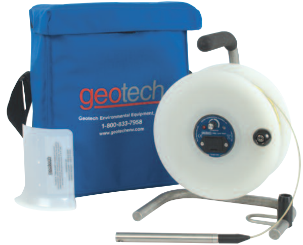
Geotech ET with optional bag